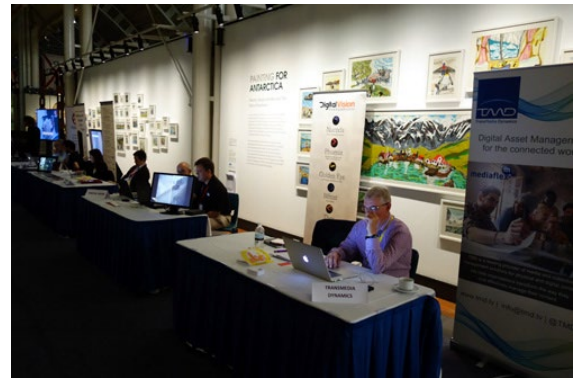
Exhibitors' stands at recent FIAF Congresses.